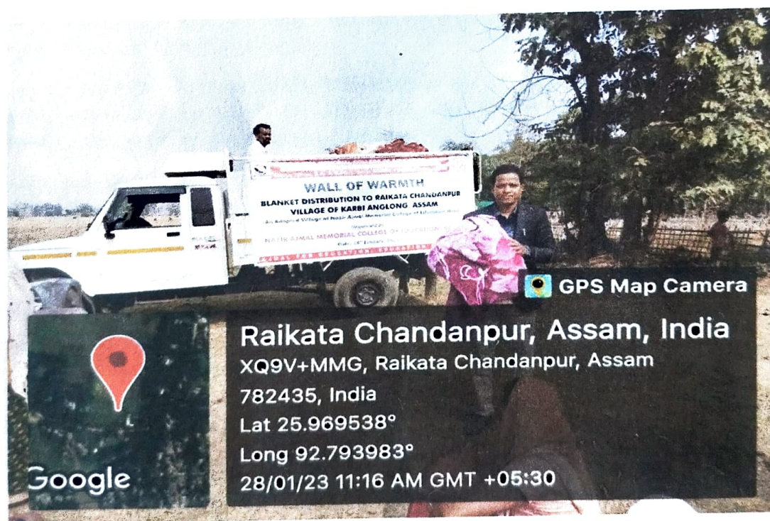
N.B: Principal of Nazir Ajmal Memorial College of Education distributing blankets at Raikata Chandanpur, Assam.