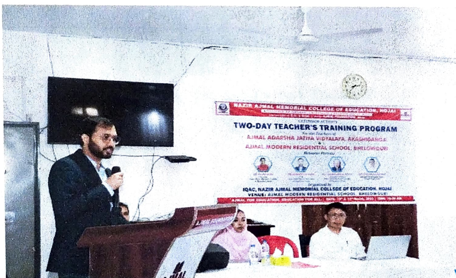
Moments from the "Two-days Teachers' Training Program"

Principal Nazir Ajmal Memorial College of Education Hojai, Nagaon, Assam-782435