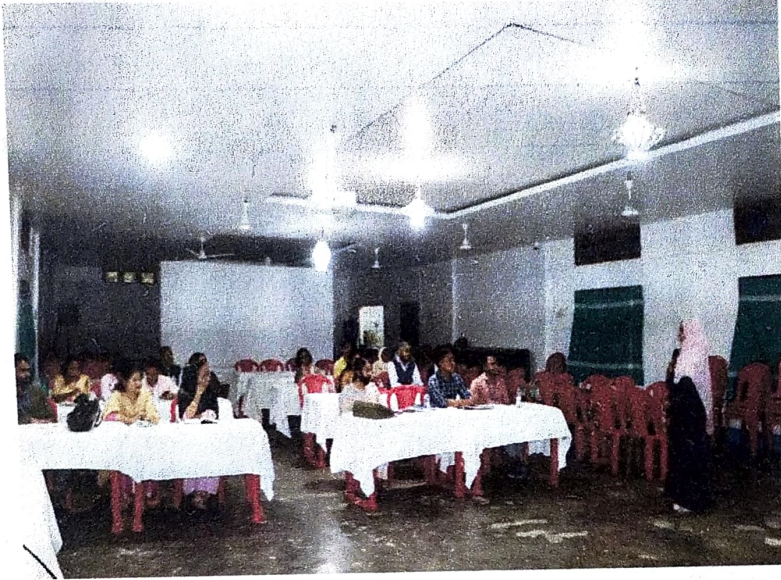
Moments from the "Two-days Teachers' Training Program"