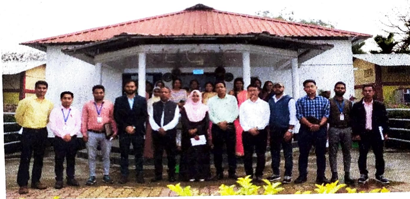
Moments from the "Two-days Teachers' Training Program"