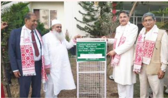
Tree plantation at the college campus