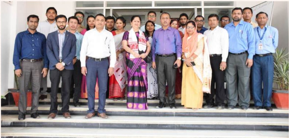
College Inspection by University Officials