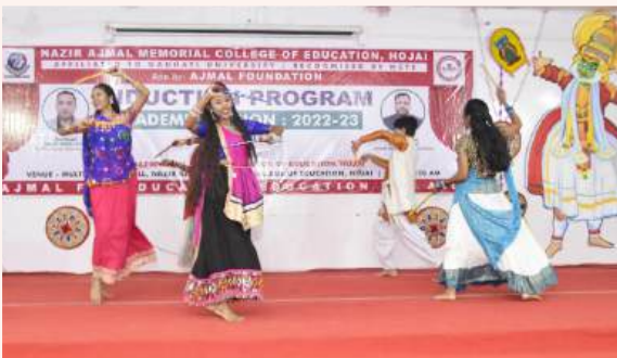
Students Induction Program 2022-23