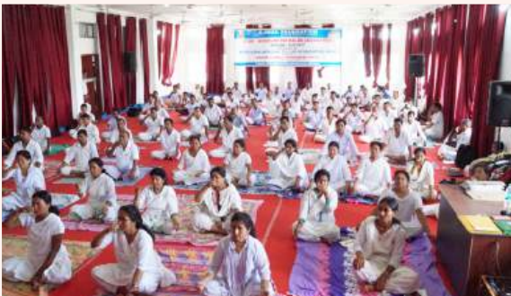
12-Day Yoga Workshop for D.El.Ed. trainees