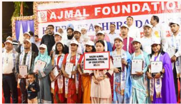
Celebration of Teachers' Day, 2023 at Nazir Ajmal Memorial College of Education, Hojai