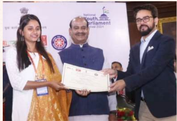
National Youth Parliament Festival organised by Nehru Yuva Kendra, Ministry of Youth Affairs and Sports, Government of India.