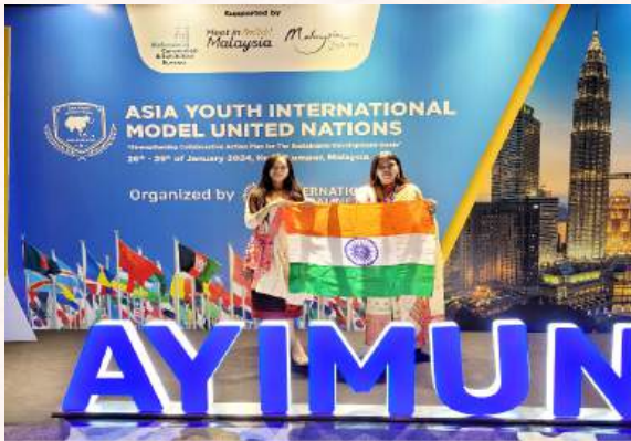
AYIMUN (Asian Youth International Model United Nations), held in Kuala Lumpur, Malaysia from 26 th - 29 th January 2024