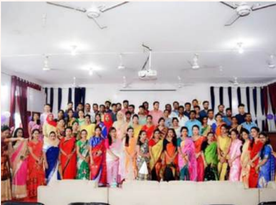
B. Ed. Batch 2016-18