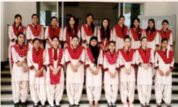
B. A. Batch 2020-23