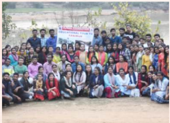
B. Ed. Batch 2019-21