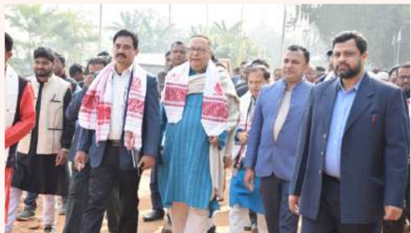
Well-wishers from Assam Sahitya Sabha visited the college