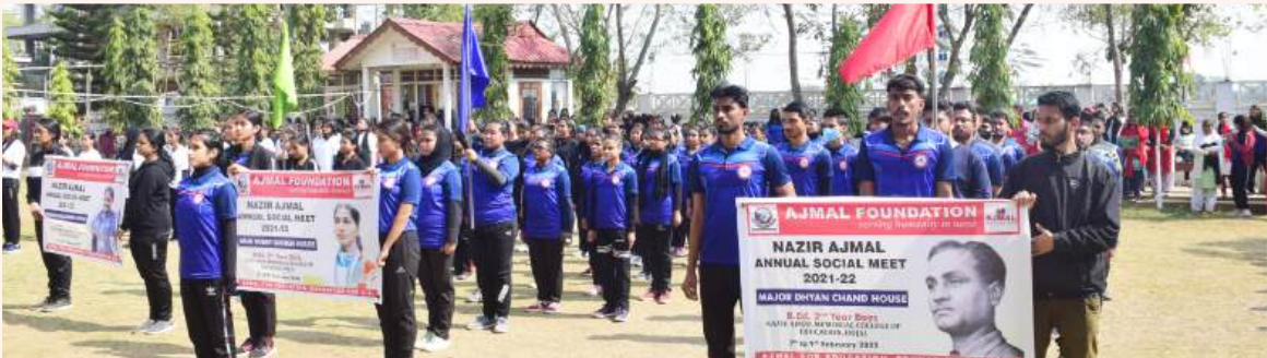
Annual Social Meet 2021-22