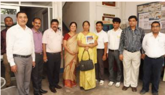
College Inspection by University officials