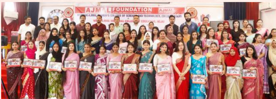
B. A. Batch 2022-25