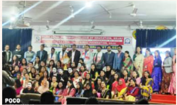
B. Ed. Batch 2021-23