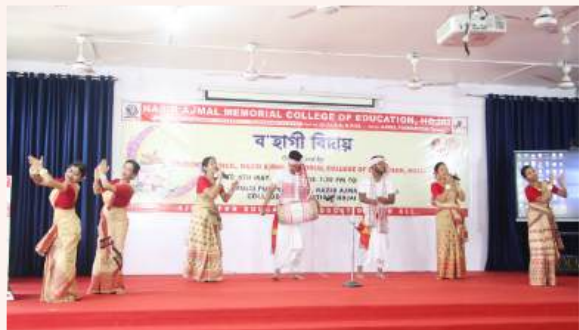
Celebration of Bihu Festival