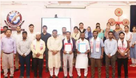
Memorandum of Understanding with Human Care Society