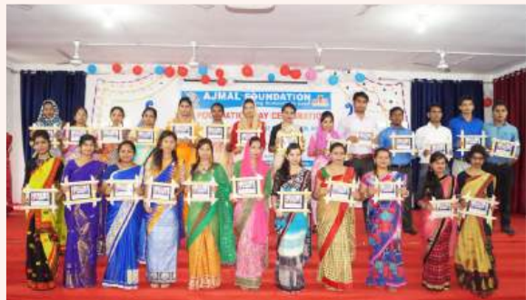
Foundation Day Ceremony of Nazir Ajmal Memorial College of Education, Hojai