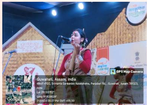
Sanskritik Mahasangram (31.01.2024) (Zeng Bihu Competition) Held at the Srimanta Sankardeva Kalakshetra (Guwahati)