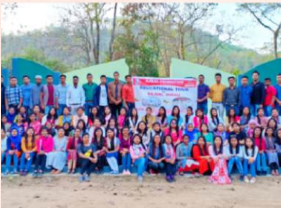
B. Ed. Batch 2018-20