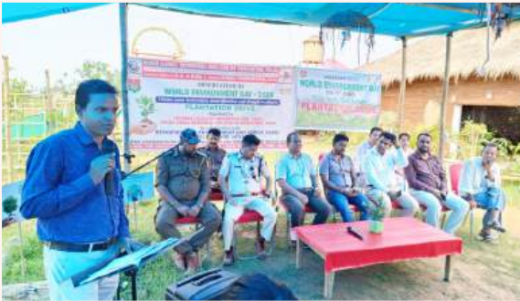
Plantation Drive at Gauranagar, the adopted village of the college