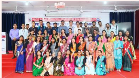
Life Skills Workshop for Self-Empowerment