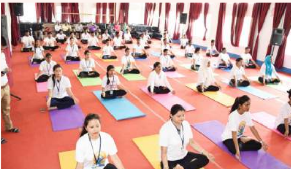
Observation of International Yoga Day