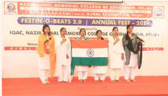
Trainees singing State Song during Festin-O-Beats2.0