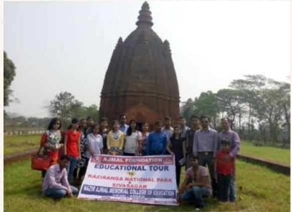
B. Ed. Batch 2015-17