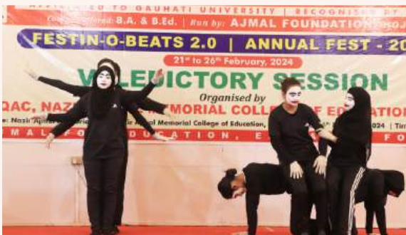
Students performing Mime during Valedictory session of Festin-O-Beats 2.0