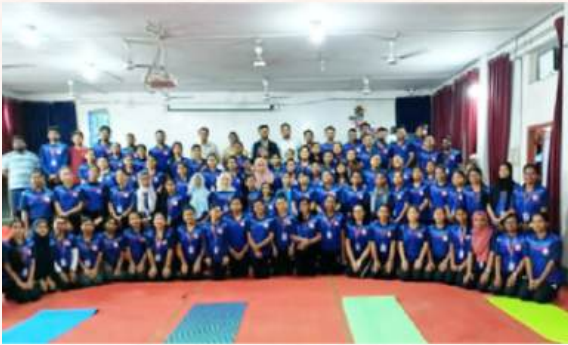
B. Ed. Batch 2020-22