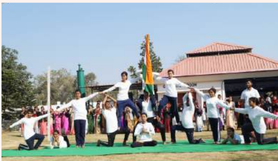
Moments from Annual Social Meet