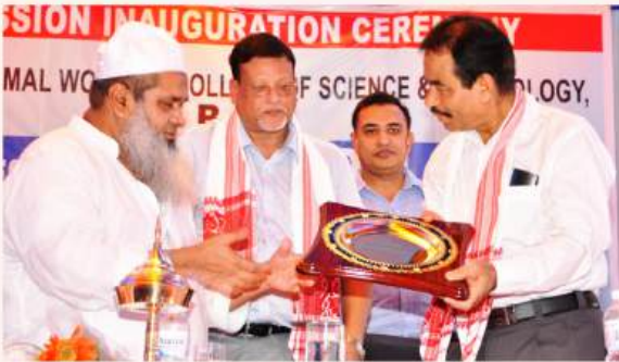
Inauguration of Nazir Ajmal Memorial College of Education, Hojai