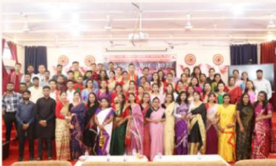
B. Ed. Batch 2022-24