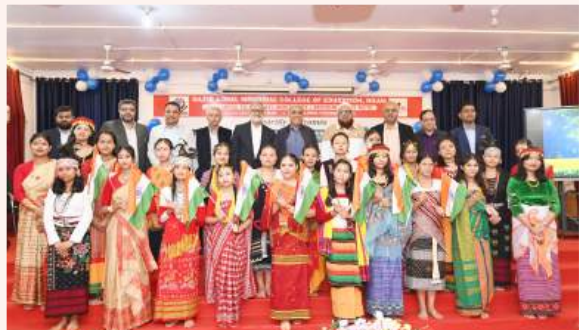
B.Ed. trainees representing the various cultural attires of India