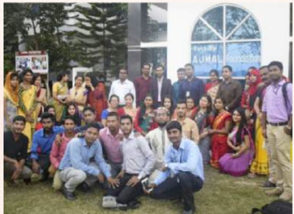
B. Ed. Batch 2017-19