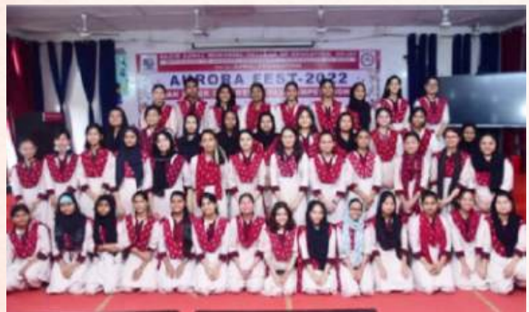
B. A. Batch 2021-24