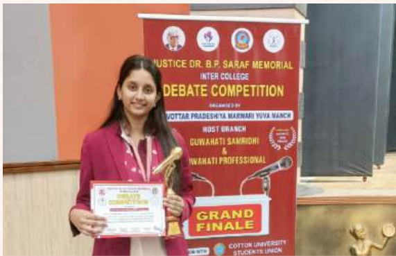
1 st Prize in Inter College Debate Competition of Purvottar Pradeshiya Marwari Yuva Manch, Nagaon Branch.