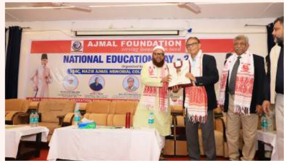
Observation of National Education Day at the college