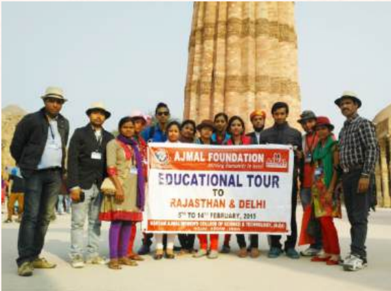
B. Ed. Batch 2014-15