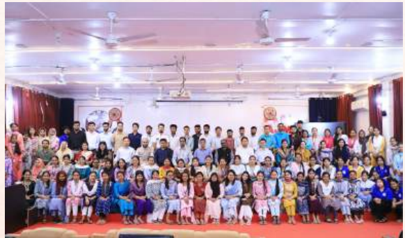
B. Ed. Batch 2023-25