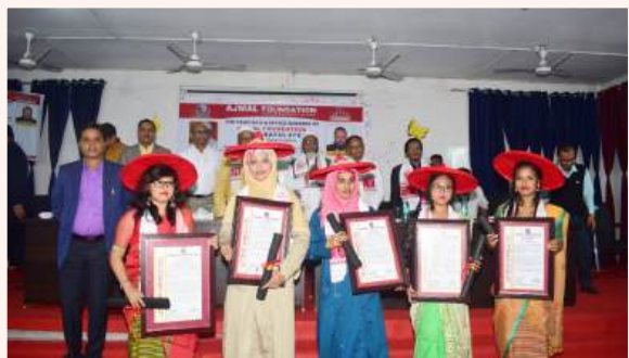
Felicitation of toppers of Gauhati University B.Ed. Final Examination