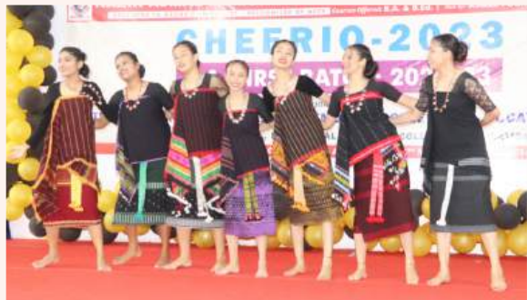
Cheerio 2023 - Farewell program for the First Batch of B.A course