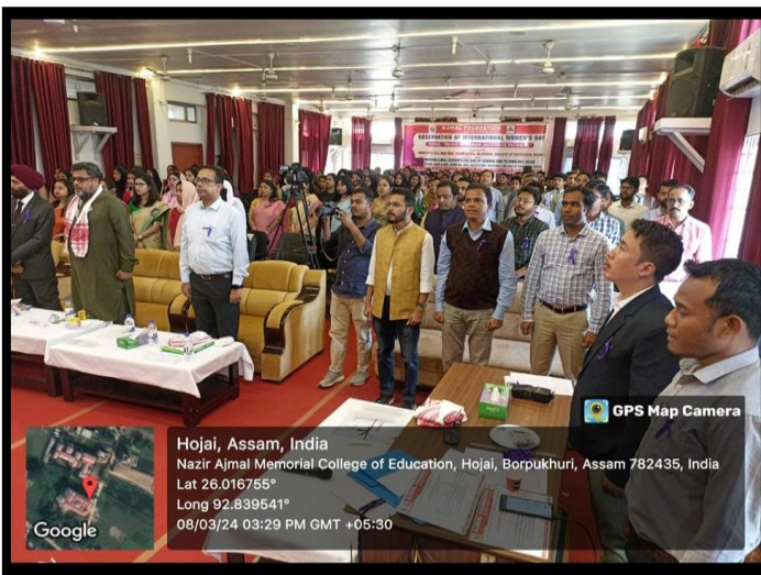
Moment when the National Anthem was sung.