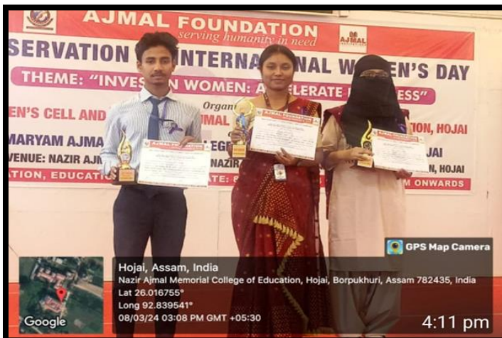
A snapshot of the award winners.