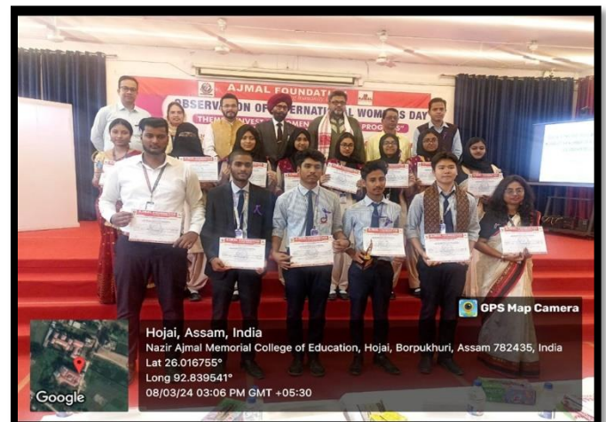
Group Photo with the participants of the competition