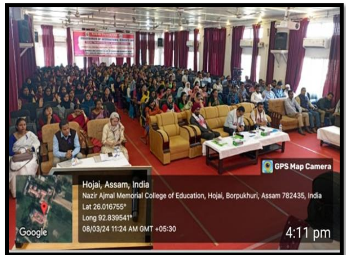
A snapshot of the audience during the event.