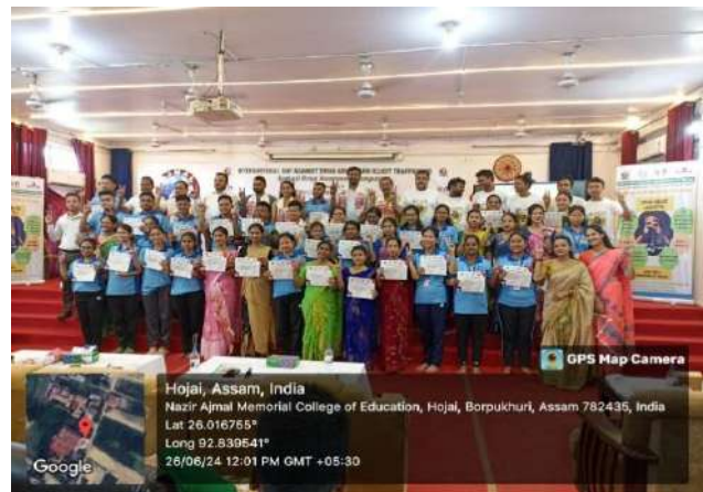
Attendees of the walkathon given certificates of participation