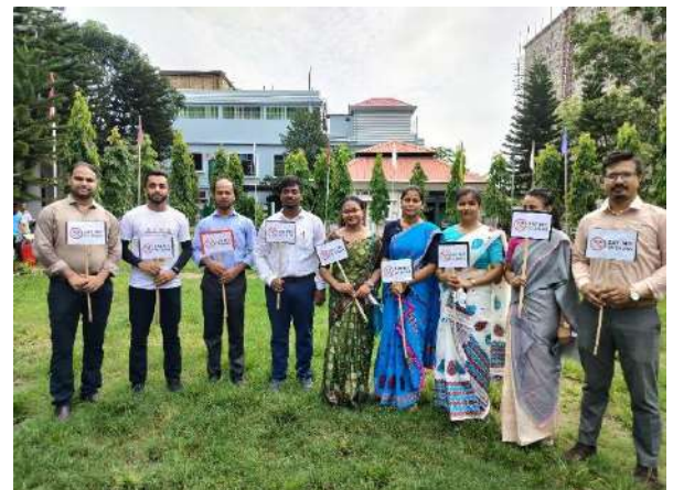
Moments after the conclusion of the Walkathon