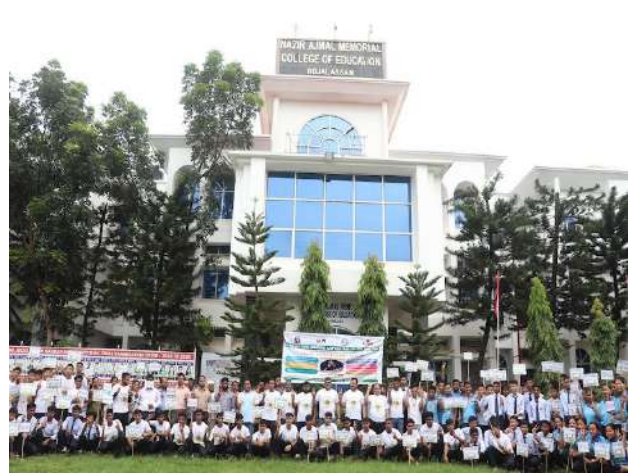
Attendees of Walkathon from Nazir Ajmal Memorial College of Education, Social Welfare Society, Users Network of Assam and Ajmal Foundation posed for a group photo