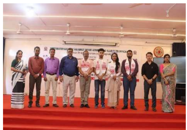
Dignitaries of Ajmal Foundation and Social Welfare Society addressing the media and posing for a group photo after the successful completion of the event