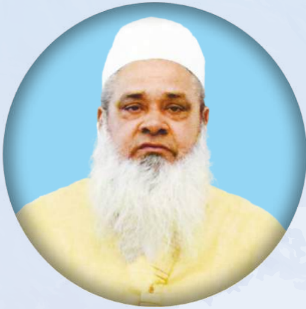
M. Badruddin Ajmal

Founder Managing Trustee Ajmal Foundation, Hojai